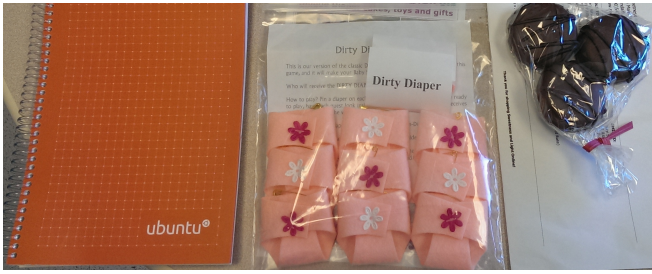
Figure 2: Received Products from Vulnerable Websites.

is still vulnerable. The added check on order ID is insufficient, thus attackers can pay for one order and bypass payments for future orders. This is one of the new vulnerabilities that we detected.